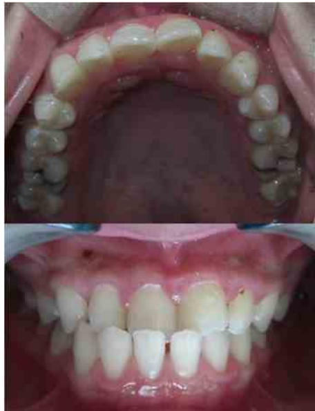
Figure 3a & 3b