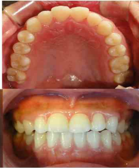
Figure 9a &amp; 9b